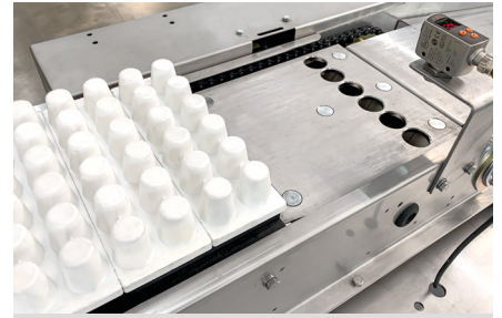
Fully automatic treatment of 12-chamber magazines